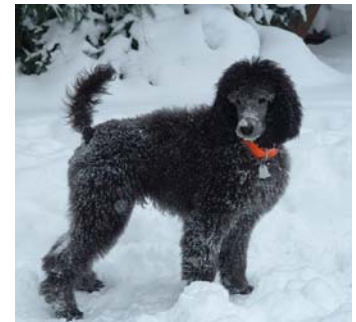
and Bing, a silver Standard Poodle, age 16 weeks, our newest addition.

Students taking lead —continued from page 2